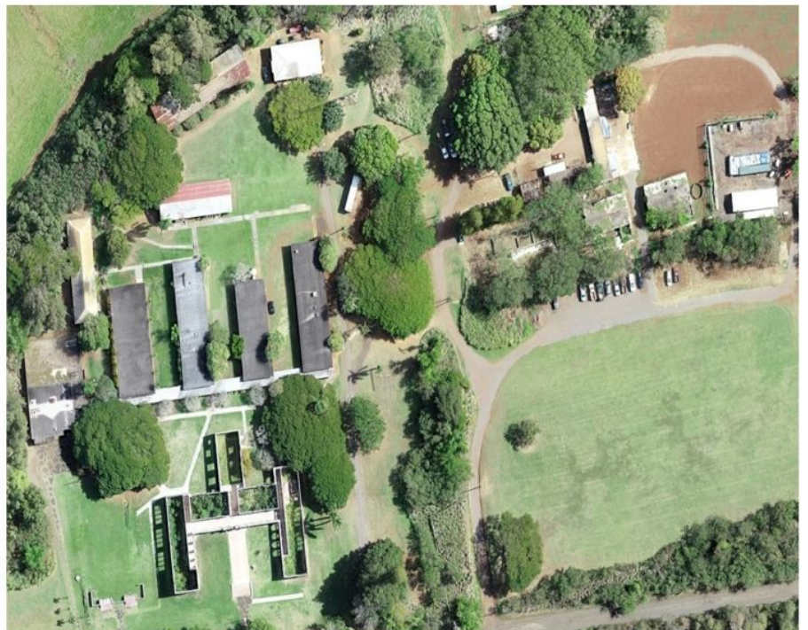
Bird's eye view of MHS Hāmākuapoko campus, 2020 - Photo courtesy of MISC.