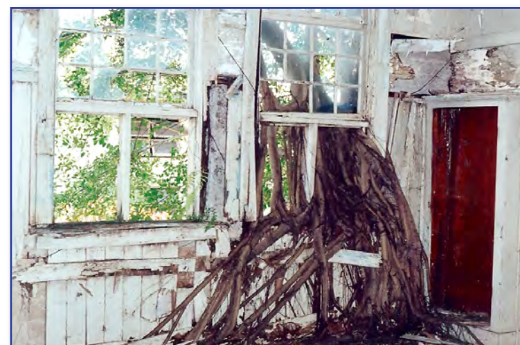
Why preservation matters. Photos of OMHS buildings prior to the preservation efforts of Friends of Old Maui High School.

Preserving the Old Maui High School campus is not just about keeping old buildings from being torn down. It is about keeping memories alive. It is about honoring the past and those who came before us. It is about making sure that the Spirit Lives On.