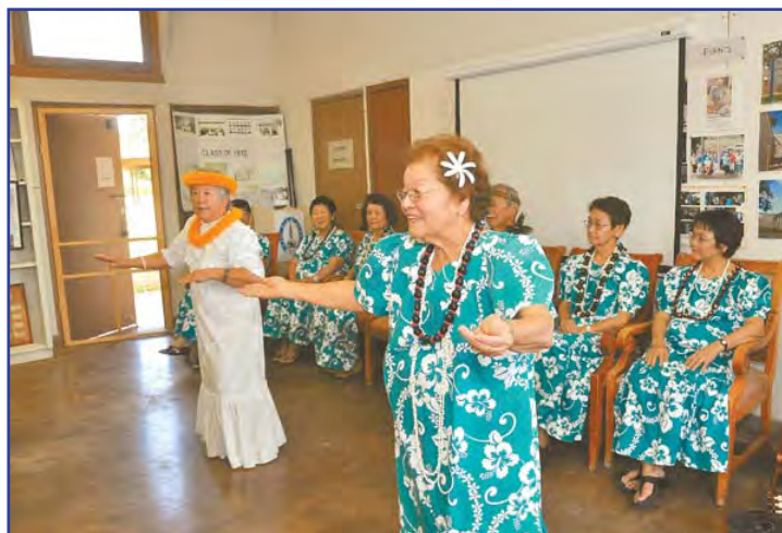
The original 1951 "May Day Court" reunites for a performance at their 60th class reunion