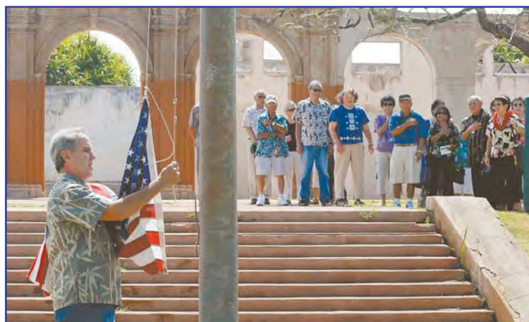
Class of 1951 participates in the traditional flag raising ceremony at the Old MHS campus

Approximately 50 alums and guests were in attendance, and a fine time was had by all.