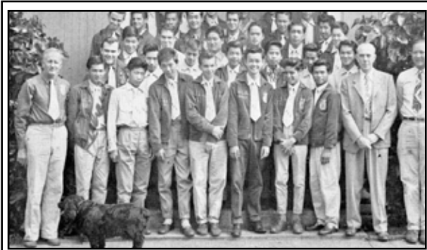
Whose dog is this and what's its name?

Putting together almost one hundred years of MHS history means sifting through scores of yearbooks, squinting at decades-old MAUI NEWS articles, pondering photos of now-demolished cottages and classrooms, and reading old Hi-Notes, MHS Handbooks and other publications. But our best source when it comes to documenting those industrious, exciting years is YOU....the students whose motto was “Onward to a better tomorrow”. . .who remember your days at Maui High and who now can help Friends prepare a complete and accurate history, so those memories will live on. Please help us answer these questions...tell us your tales of student days.. write us, or e-mail, answers to these questions and more.