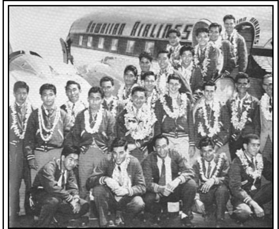
What team? Where are they coming from?