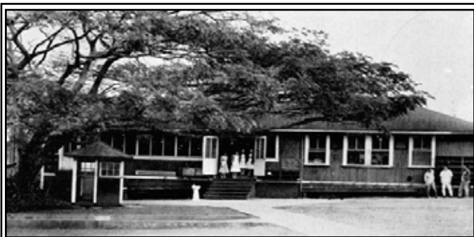
What is this building??